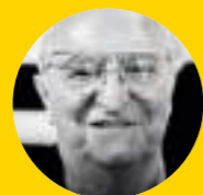
34 Salon Gourmets

3* Michelin, Chef / Owner Arzak Restaurant, San Sebastian - Spain